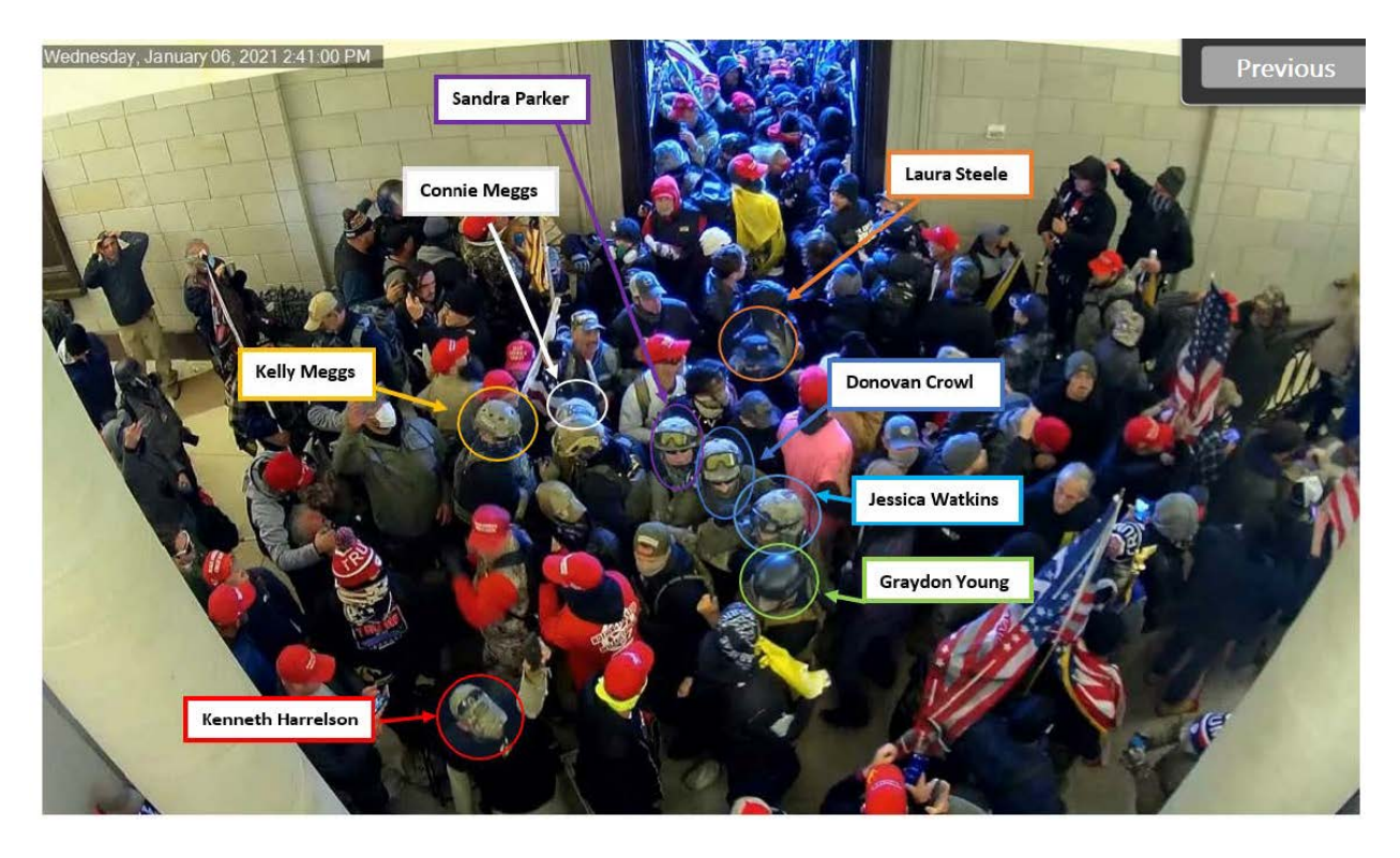
Figure 14. Oath Keepers in protective combat gear breach the Capitol Building.

throwing objects at the officers and deploying chemical irritants against them. This group of Defendants—each suited up in protective combat gear—continued to maintain their Stack formation as they entered, as depicted in Figures 13 and 14.