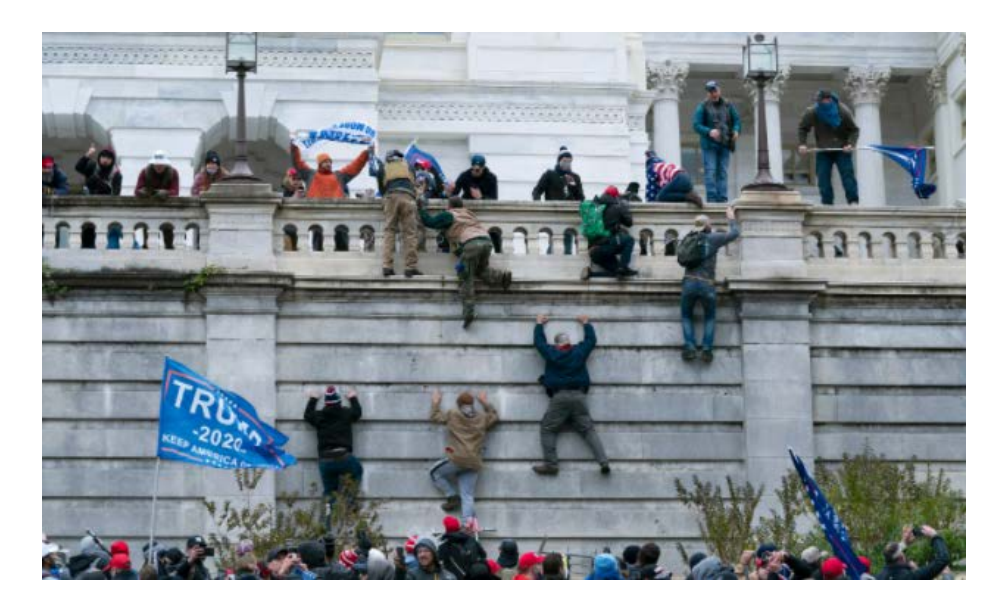
Figure 7. Members of the crowd scale the walls of the Capitol Complex.

192. Members of the Proud Boys and Oath Keepers forced their way past the barricades, assaulted officers, and rushed toward the Capitol building.