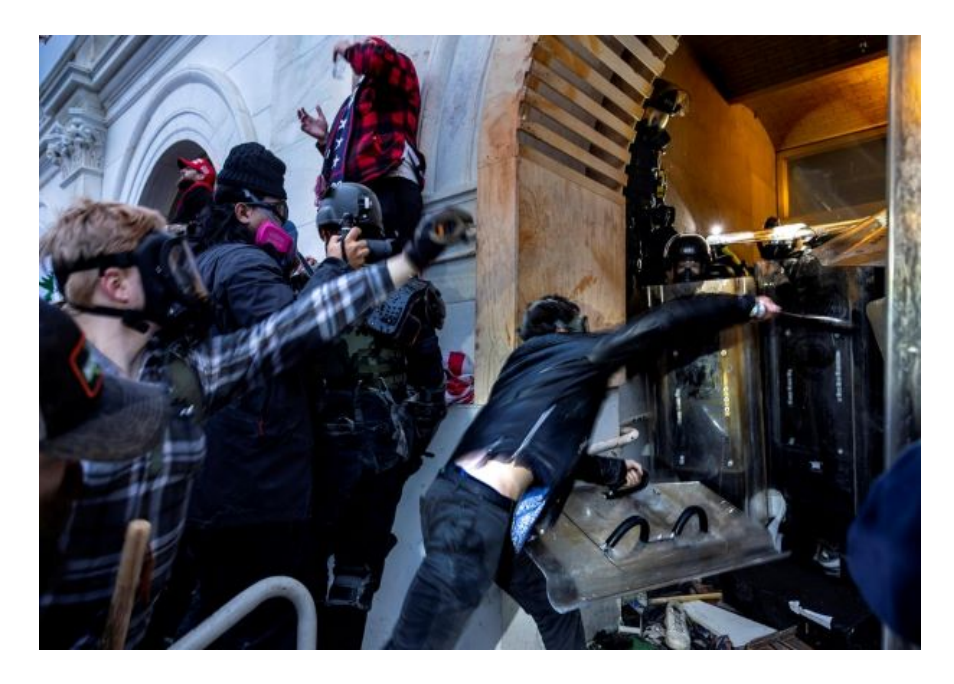
Figure 28. The crowd attacked police as they began to breach the Capitol building.