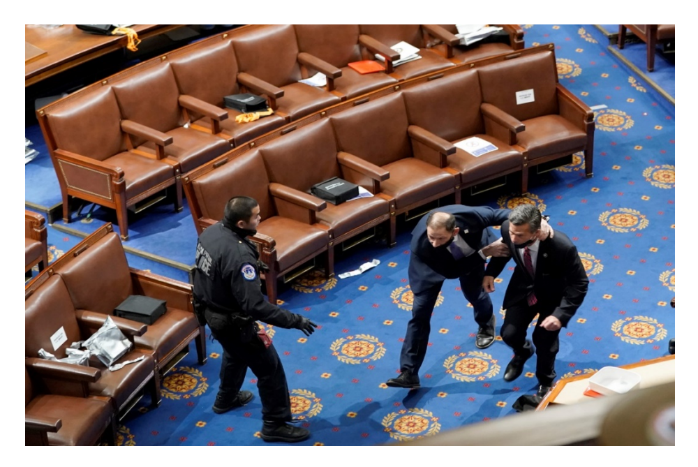
Figure 22. Evacuation of Members of Congress