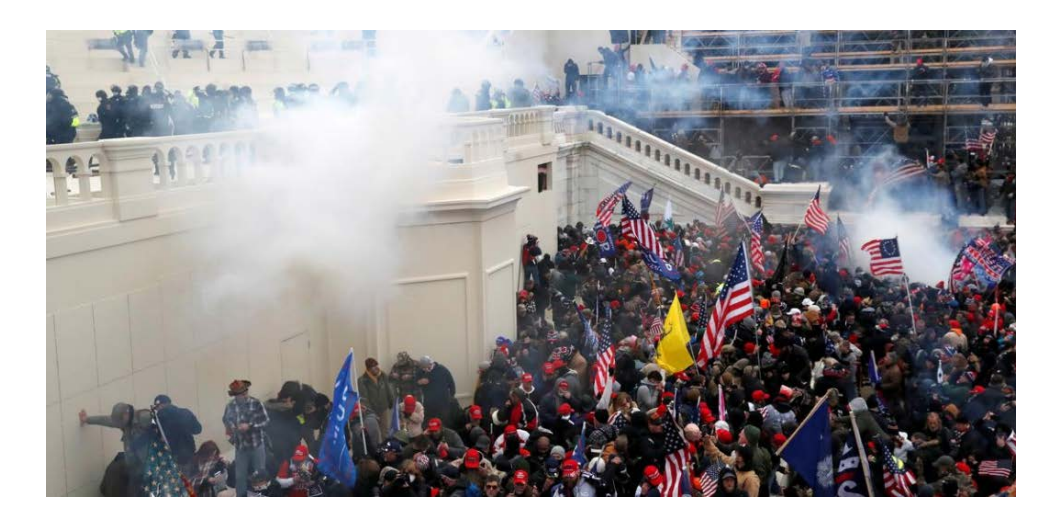
Figure 11. Storming the Capitol Complex

198. At approximately 2:15 p.m., the mob, led by several individual Defendants, breached the Capitol by breaking windows and climbing inside the building, opening doors for co-conspirators to follow. See Figure 12.