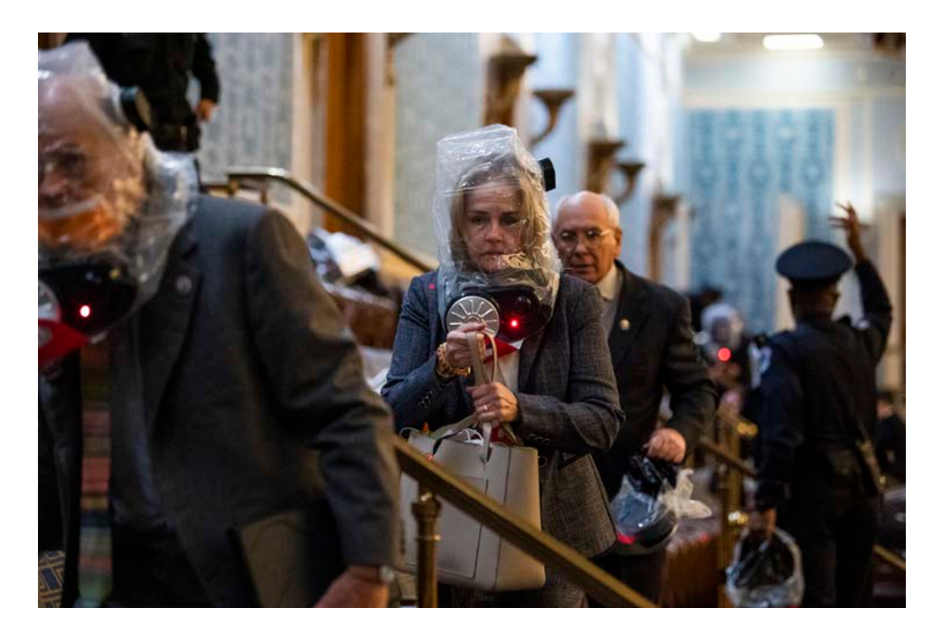
Figure 23. Evacuees wear gas masks as they flee the Capitol.