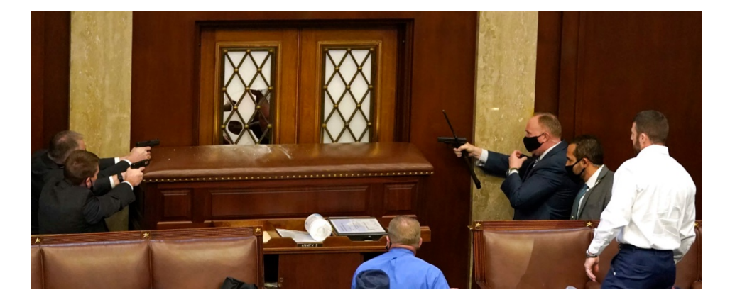
Figure 20. Capitol security barricades the House Chamber with weapons drawn.

228. Police and security personnel barricaded the doors to the House chamber, where lawmakers and others were forced to take cover on the ground as the Defendants and others beat on the doors and attempted to force their way through the barricades. See Figure 20.