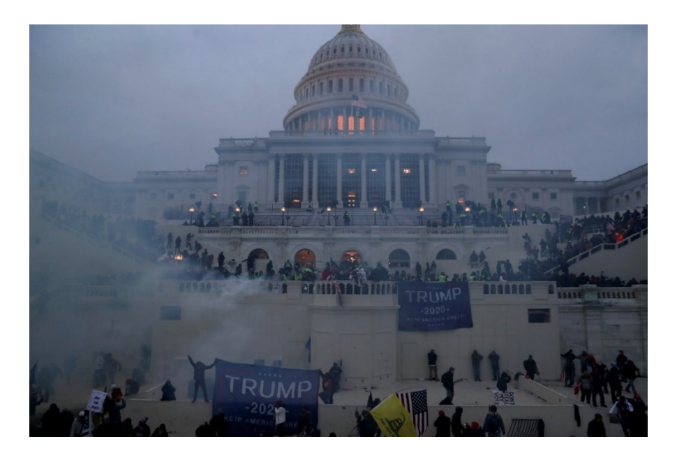
Figure 27. The Capitol on the afternoon of January 6th

233. The Joint Session could not reconvene until approximately 8:00 p.m. At approximately 3:40 a.m. on January 7th, Vice President Pence affirmed the election results, formally declaring now President Biden the President-elect.