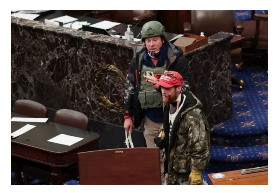
Figure 26. Standing on the Senate floor, holding several plastic zip handcuffs232. For hours that day, Defendants and thousands of others entered and occupied the grounds of the Capitol building using violence.

231. Several members of the Defendants' cohort, including some of those who entered the Congressional chambers, carried plastic zip handcuffs for the purpose of capturing and detaining persons, including members of Congress. See Figure 26.