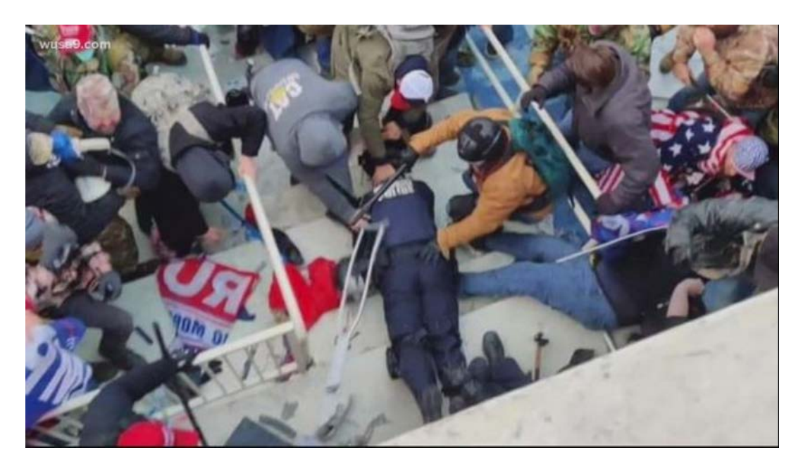
Figure 30. The crowd of Defendants and others dragging and beating an MPD Officer on the Capitol steps

238. One MPD officer was beaten by members of the crowd with sticks and crutches, including by one person wielding an American flag. See Figure 30. The MPD officer later recalled during his testimony before the House Select Committee that attackers were lunging at him and trying to grab his gun while chanting "kill him with his own gun."