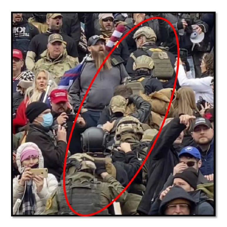
Figure 13. Oath Keepers advance on the Capitol in stack formation.

208. At 2:35 p.m., the Stack maneuvered together in an organized and coordinated fashion up the steps of the Capitol, with each person keeping a hand on the shoulder of the person in front of them, as depicted in Figure 13.