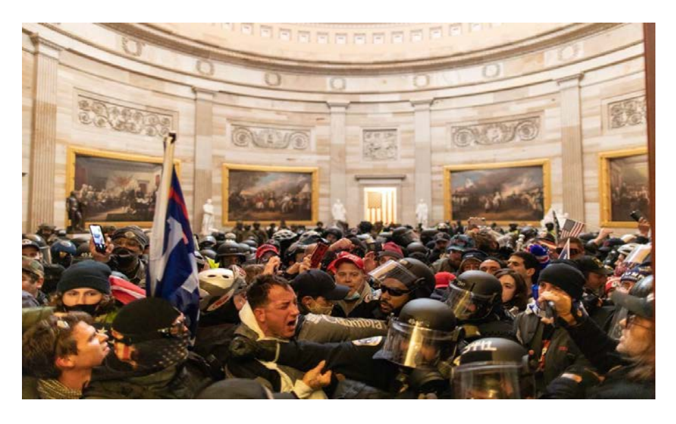
Figure 29. The crowd clashed with police inside the Capitol building.

236. Members of the crowd sprayed law enforcement officers with bear mace, a pepper spray designed to deter bear attacks that is more concentrated than self-defense products meant to deter human attacks. When sprayed into the face, it causes temporary loss of sight, nasal congestion, and, in some, difficulty breathing.