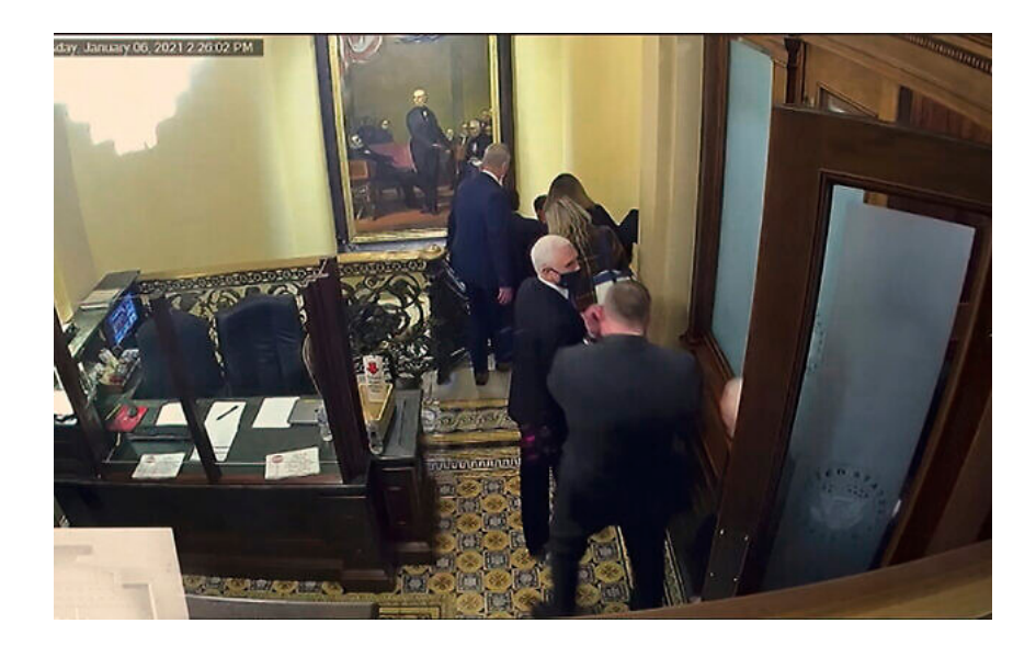
Figure 24. Vice President Pence in the process of being evacuated from the Capitol