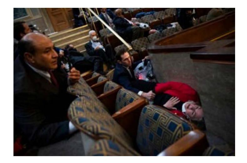
Figure 21. Rep. Jason Crow of Colorado, center, comforts Rep. Susan Wild of Pennsylvania while taking cover as the Defendants and others storm the Capitol.

229. At approximately 2:30 p.m., Defendants' unlawful attack on the Capitol had become so disruptive and such a threat to safety and security that congressional staff, members of Congress, and Vice President Pence were evacuated. The Joint Session was halted while law enforcement officers worked to restore order and clear the Capitol of the unlawful occupants, including Defendants.